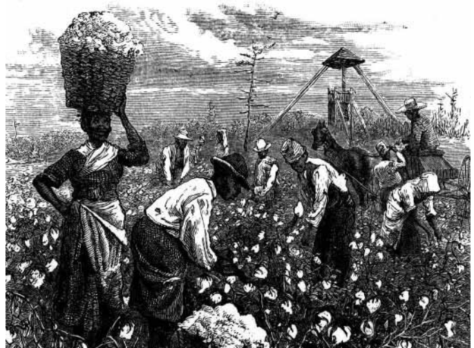
Slaves Working in a Cotton Field

Slave state delegates wanted slaves to be counted as part of the population that determined representation in the House, even though no state gave slaves the right to vote for those representatives. Northerners thought that this position was