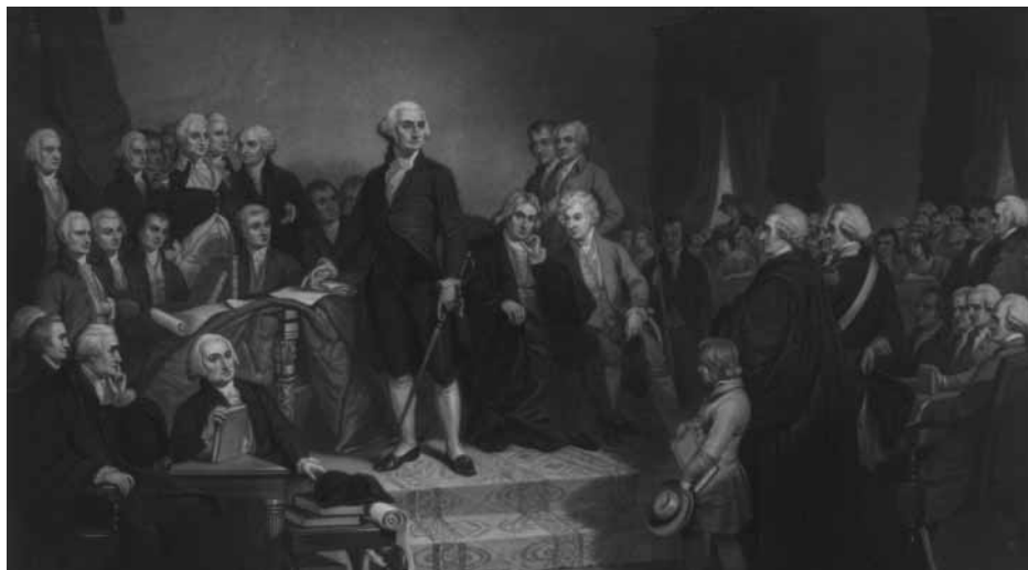
George Washington's Presidential Inauguration

The process for creating the new government began, elections were held, and the first Congress met in March of 1789. However, another month passed before a quorum of members of Congress arrived in New York, the first national capital. With Congressional approval of the electoral college, George Washington was sworn in as the first President. Then North Carolina approved the Constitution 194-77 in November of 1789, and finally defiant Rhode Island (dubbed “Rogue” Island by its critics) gave its approval in the closest ratification vote of any state, 34-32, in late May of 1790. Despite strong opposition and several close convention votes, the Constitution went into effect without serious further opposition.